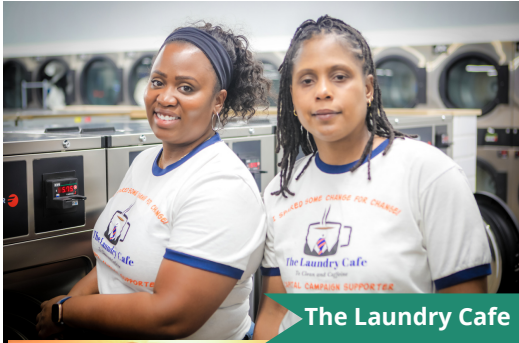
The Laundry Cafe

To advance entrepreneurship in communities of color, The Aux will provide high-quality commercial space, offer technical assistance, and provide opportunities for shared marketing and peer learning.